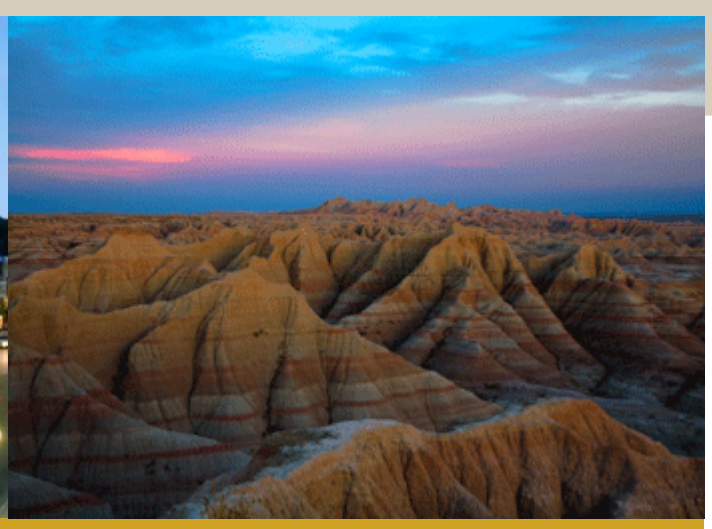
Badlands National Park